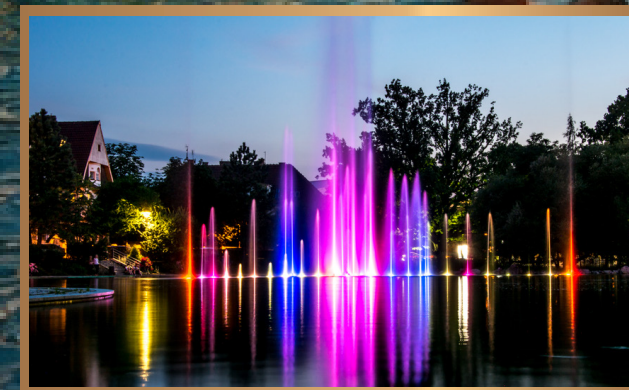
A musical fountain that turns water into emotion

LED screen parties , mocktails in hand, memories in motion