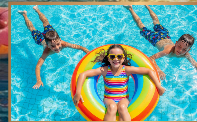
A kids' pool zone where laughter never echoes alone