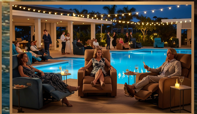
Recliner chairs that invite you to do nothing—and enjoy it

— ■ Birthdays. Celebrations. Unplanned gatherings. ■ — This is where moments stop being ordinary and start becoming stories.